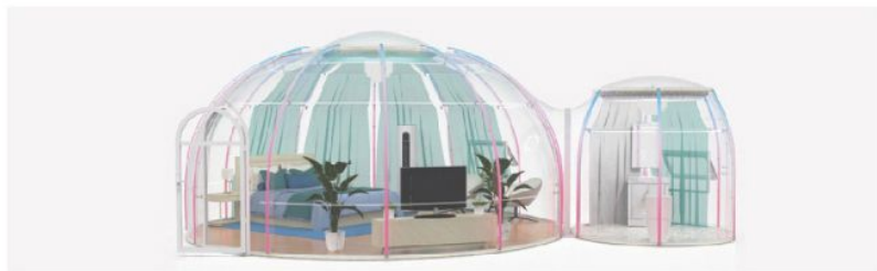
6m & 2.5m Dome