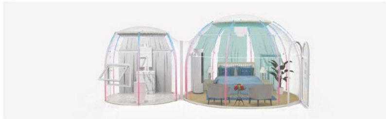
4m & 2.5m Dome