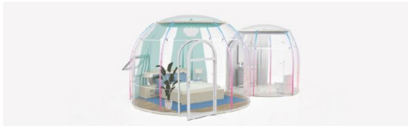
3.5m & 2.5m Dome