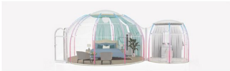
5m & 2.5m Dome